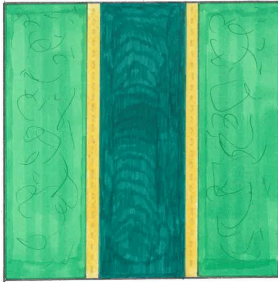
GREEN BURSE - DESIGN A.