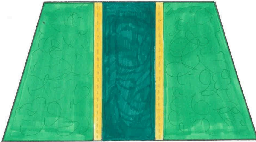
GREEN VEIL- DESIGN A -