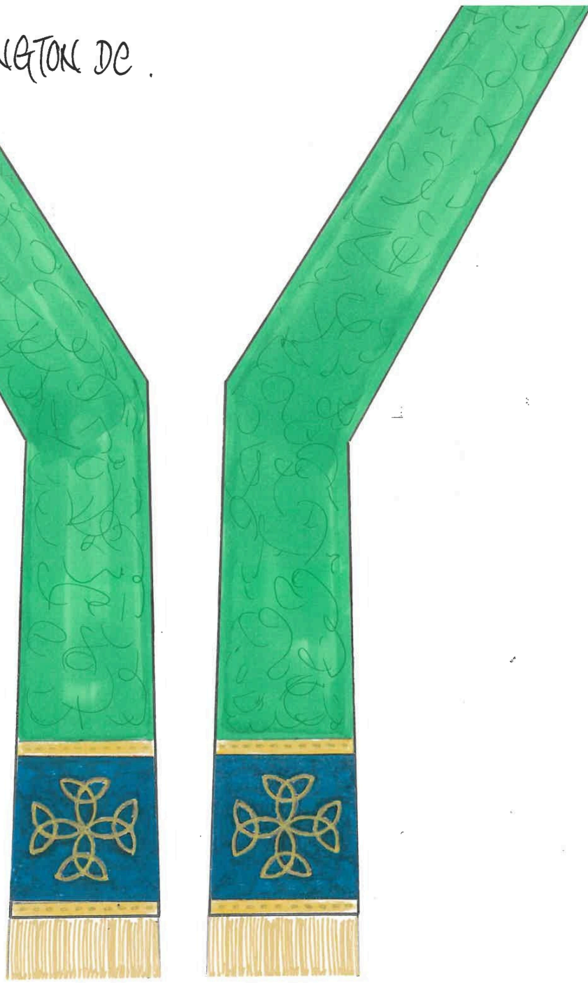
GREEN DEACON STOLE . DESIGN A .