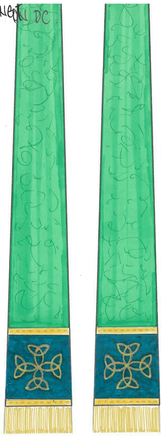
GREEN STOLE - DESIGN A.