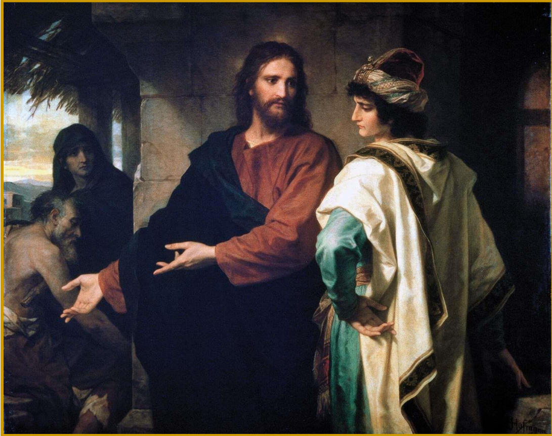
Christ and the Rich Young Man