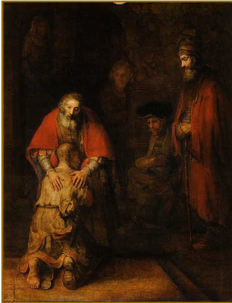
The Return of the Prodigal Son Oil on canvas Rembrandt van Rijn (1606-1669)