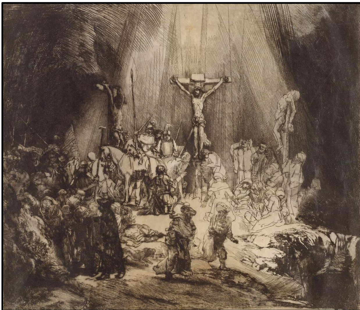
Christ Crucified between the Two Thieves: The Three Crosses Drypoint printed on vellum Rembrandt van Rijn (1606-1669)