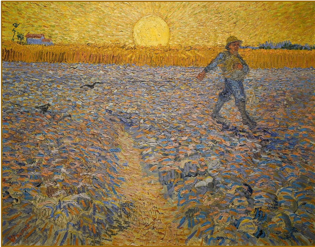
The Sower (Sower at Sunset) Oil on canvas Vincent van Gogh (1853-1890)